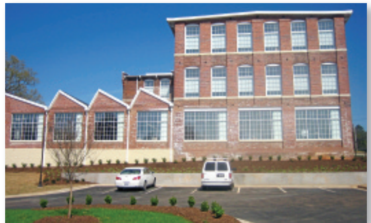
The newly renovated Lillian Mill and home of Monarch's administrative offices in Albemarle.