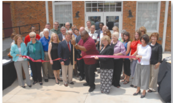
Ribbon cutting of Monarch's new administrative offices.